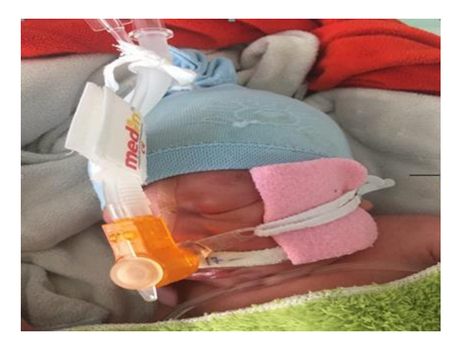
Fig.1: An infant undergoing a sleep study with nasal CPAP