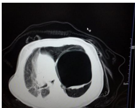
Fig.2: CT Scan with CCAM left lung involving entire lobe