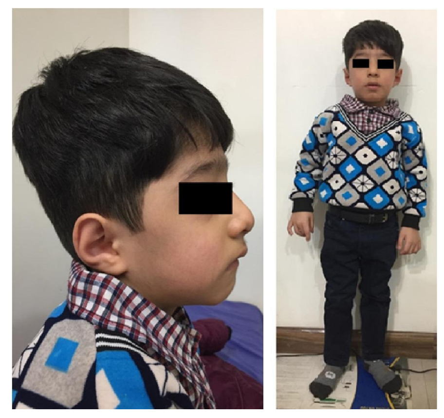
Fig. 2: Long philtrum, short nose, low-set ears, and flat round face can be seen in these photos. It should be noted that some facial features, such as hypertelorism and short palpebral fissures cannot be seen in the pictures due to protecting the identity of described case.