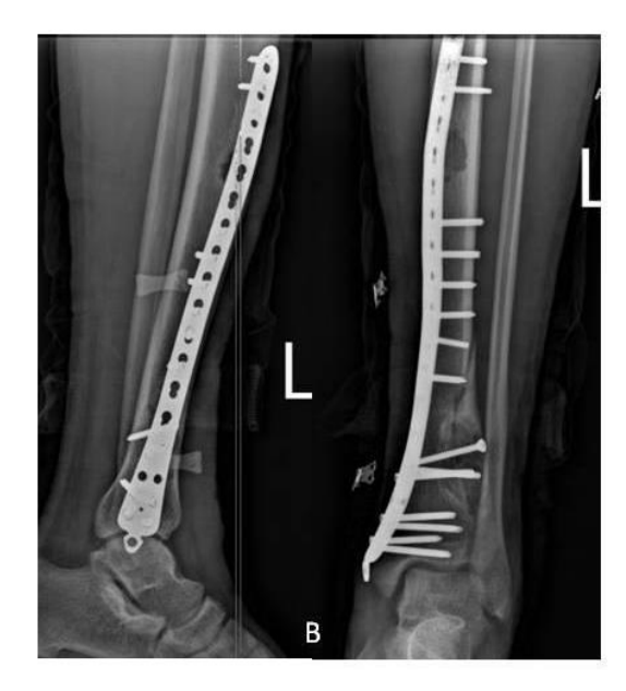
Fig. 3: Immediate Postoperative radiography (A), 3-month postoperative follow-up X-ray (B)