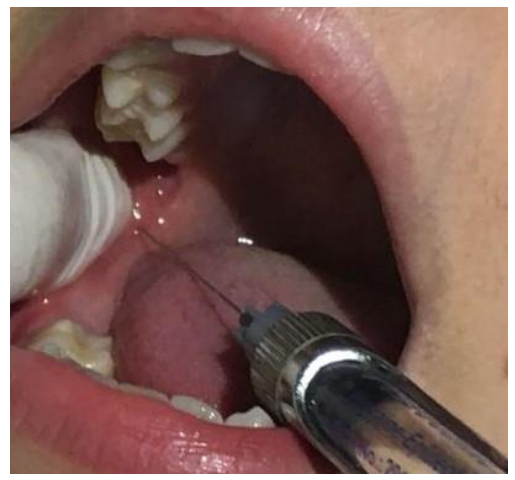
Fig.2: Tactile method to define insertion point for IANB.

injection site. A small amount of solution was immediately injected after tissue penetration and injection was continued along the way to reach the mandibular foramen. The needle was pulled out by 1 or 2 mm once it touched the bone surface (1.5 to 2 cm in depth), and the injection was slowly deposited following negative aspiration (Figure.2). To administer IANB based on the visual method, the child opened his/her mouth as much as possible. Thereafter, the needle was placed in the tip of the pterygomandibular triangle (the intersection of the internal oblique ridge and pterygomandibular raphe) with the bevel oriented toward the bone, and the syringe was placed in the corner of the lips on the side opposite. The remaining procedure was similar to that described for the tactile method (Figure.3).