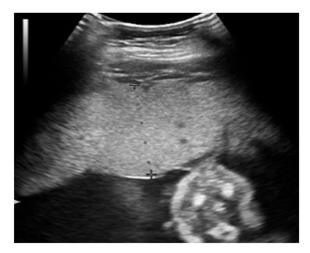
Fig.1: Ultrasound assessment of placental thickness.

measured by a single laboratory unit. A value \leq 0.5 MOM was defined as a low level of PAPP-A (15). Based on PAPP-A levels, patients were divided into two groups: women with PAPA-A values of \leq 0.5 and > 0.5 MOM were defined as exposed and unexposed groups, respectively.