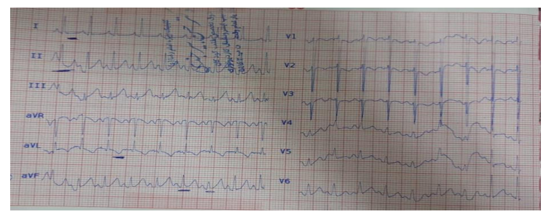
Fig. 4 . ECG showing flat T wave in v1 lead and invert T in aVL lead, which are suggestive of myocardial infarction.

ESR (erythtocyte sedementation rate), CRP (C-reactive protein), UA (urine analysis), WBC (white blood cells), PLT (platlets), Hb (hemoglobin), CPK-MB (creatine kinase-MB), AST (aspartate aminotransferase), ALT (alanine aminotransferase), ALP (alkaline phosphatase).