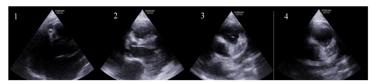
Fig.3 . Echocardiography showing coronary dilation and large multiple aneurysms in LMCA, LAD, and RCA in addition to large clots in LMCA and LAD. LMCA: left main coronary artery, LAD: left anterior descending artery.