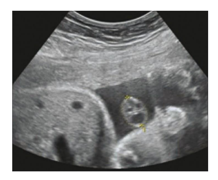
Fig. 1: Correct measurement of the cord area in transverse section and in the floating site of the cord.