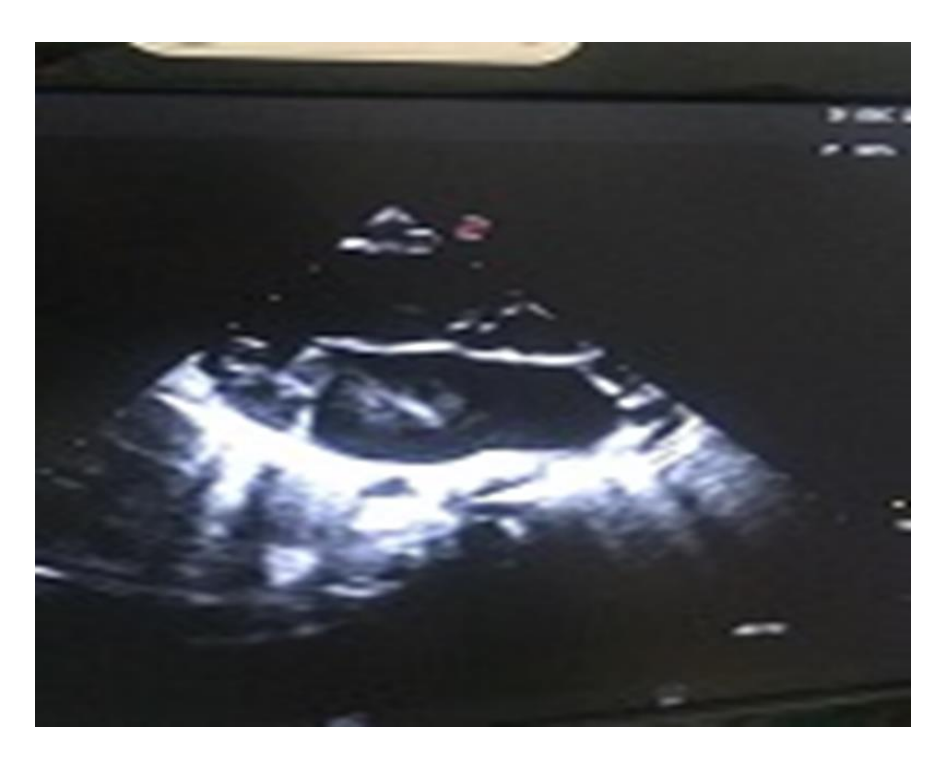
Fig.2: Echocardiography of a left atrial mass, attached to the atrial septum.