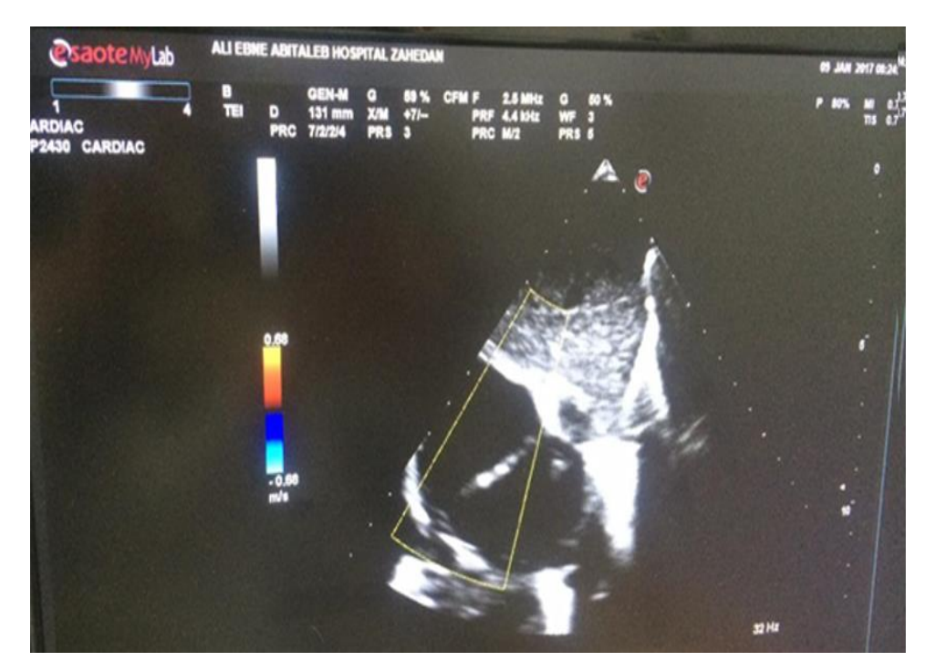
Fig.4: Postoperative Echocardiography.