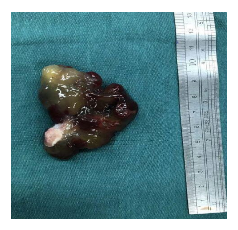
Fig.3: Size and appearance of atrial myxoma.