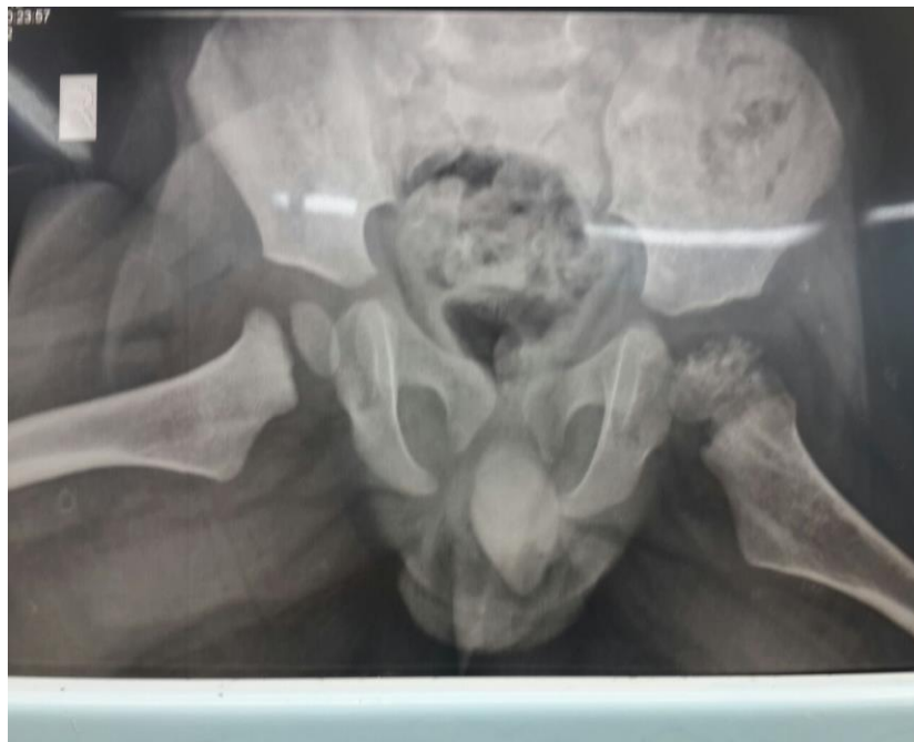
Fig.3: Follow-up X-ray pelvis anteroposterior.