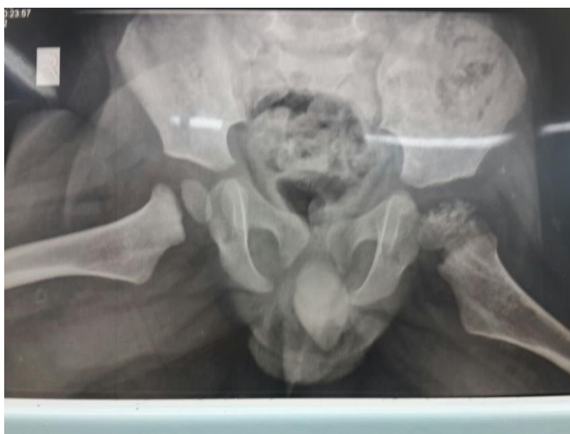
Fig.4: Follow-up X-ray frog-leg (containment is acceptable).