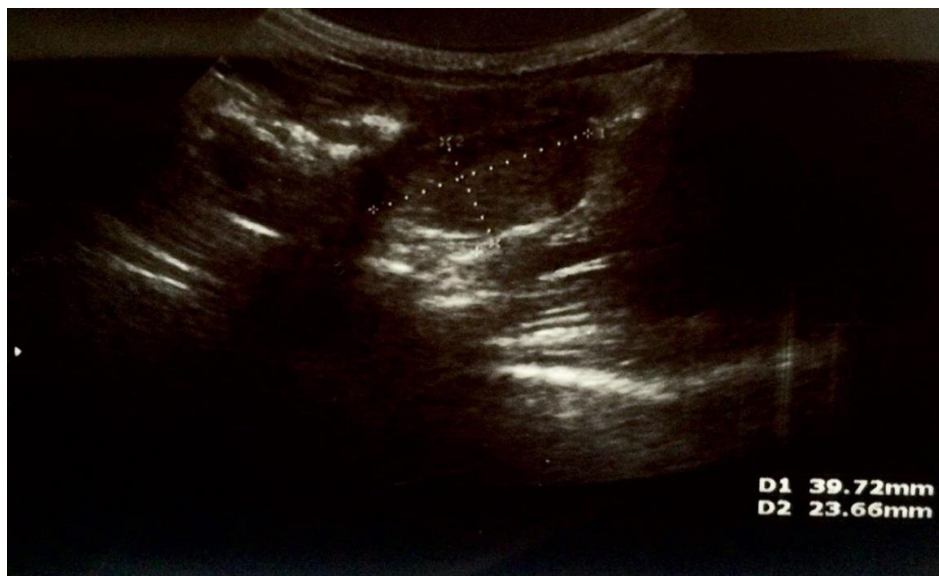
Fig. 3: Sonography of the patient with extended left ovary before surgery.