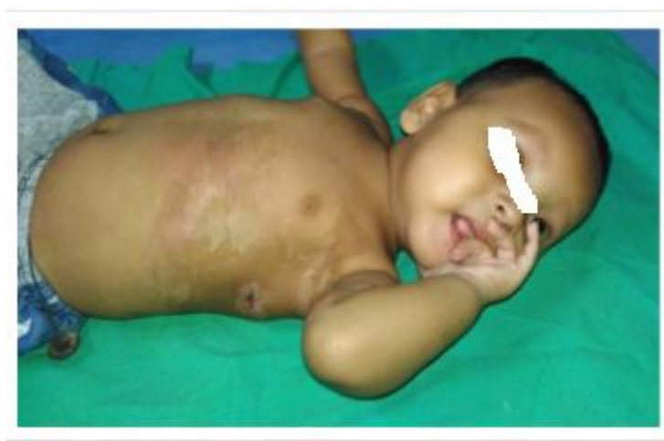
Fig.2: Baby at the time of discharge.