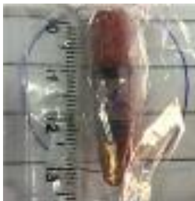
Fig. 3: The extracted pencil measuring 3 cm

No orbital hemorrhage occurred after removal of the pencil. Indirect ophthalmoscopy was done and periphery of the retina was intact. Forced duction test was normal. The entrance wound was repaired in a routine manner. After surgery, systemic antibiotics were continued for two days and then the patient