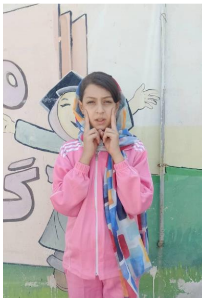
Fig. 20: Energy Yawn

right and left muscles of the jaw. To find the jaw muscles, one can first find the corner muscles of the jaw that are connected, then gently move, tap, and squeeze her fingers when they touch the stiff muscle, that is, they are in the right place. While opening her mouth like a yawn, she rubs the jaw muscles and gently closes her jaws after yawning, repeating this process several times.