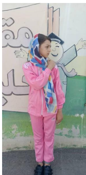
Fig. 13: The Owl

2-5-13. The Owl: The student stands or sits comfortably. She raises one hand to the opposite shoulder and hooks it, rotating an area of the trapezius muscle between the neck and shoulder to the side where she holds the muscle with her hand, and takes a deep breath. As she turns her head down and to the other side, she releases her breath with 8 numbers. Imagining drawing a smiling face, she raises her head again and starts from the hooked hand. This movement is repeated several times with both hands.