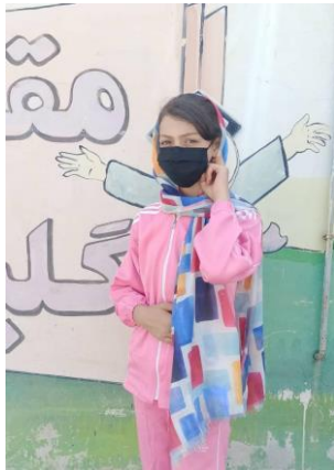
Fig. 16: Balance Buttons

2-5-17. Drink Water: Drinking some water helps to stay alert and think; because all the chemical and electrical functions of our brain and central nervous system depend on good electrical conduction between the brain and other body senses.