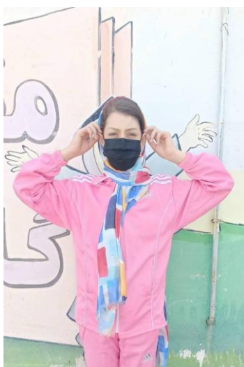
Fig. 21: Thinking Cap

2-5-21. Thinking Cap: The student stands or sits and gently points her ears with her thumb and forefinger, allowing her thumb to slide up and down. She repeats this movement two or more times.