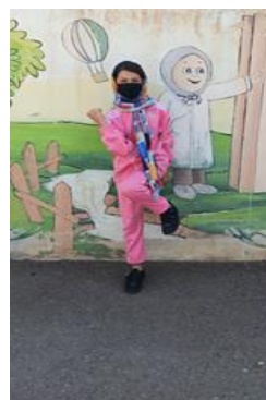
Fig. 2: Cross crawl

left hand to the knee of the right foot, doing this movement with 10 repetitions.