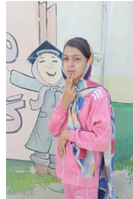
Fig. 18: Earth Buttons

2-5-18. Earth Buttons: The child sits comfortably and places her index and middle fingers on the chin, placing the palm of her left hand above the navel so that her fingers are pointing down.