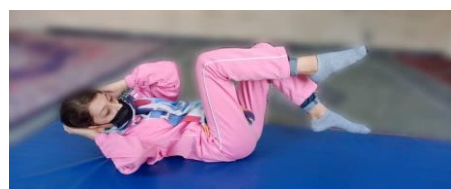
Fig. 3: Sit-Up Cross Crawls

2-5-3. Sit-Up Cross Crawls: The student lies on her back on a solid surface. Bends the knees towards the head and lifts the legs off the ground. She places her hands behind her back, raising her heads a few inches off the ground so that they do not stretch her necks; slowly and simultaneously brings her elbows to the knees of the opposite foot, and turns her back as far as she is comfortable. Then, she brings her elbows and knees apart again. At the same time, she brings the elbow of the other hand to the knee of the other foot.