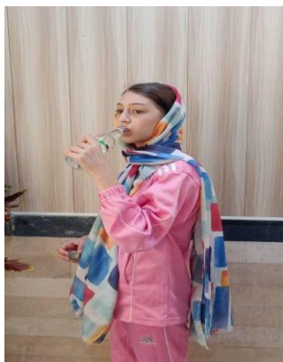
Fig. 17: Drink Water

2-5-17. Drink Water: Drinking some water helps to stay alert and think; because all the chemical and electrical functions of our brain and central nervous system depend on good electrical conduction between the brain and other body senses.