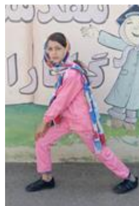
Fig. 10: Calf pump

2-5-10. Calf pump: The student stands in front of a wall and leans on it, brings the right foot back, and lifts the heel, leans on the left foot, and takes a deep breath, releases with the breath and the heels in 8 numbers. She brings the right heel to the ground. Feels comfortable and raises the heel again and repeats her action for 3 times. This movement is done with both feet.