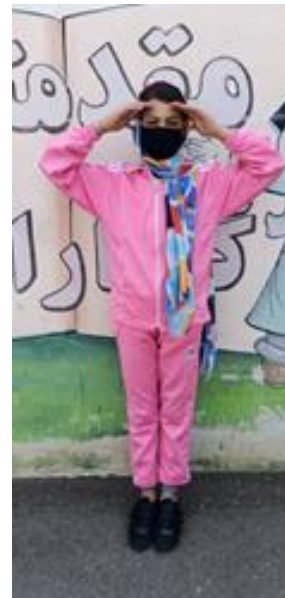
Fig. 22: Positive Points

2-5-22. Positive Points: The students sit or stand and cross their benches in front of each other; and do not hook her thighs together. Then they place all fingers, except the thumb, horizontally on the forehead. To be more effective, they can hook up and put their tongue on the roof of the mouth.