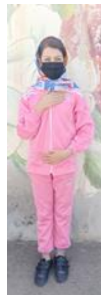
Fig. 15: Brain buttons

2-5-15. Brain buttons: The student massages two points under the collarbone with one hand while holding the other hand on the navel. This activity takes one minute for each hand.