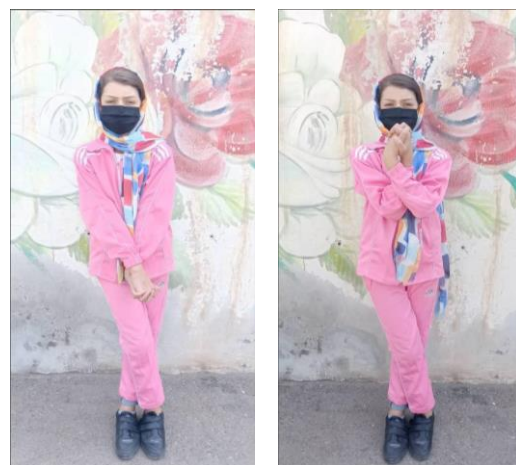
Fig. 23: Hook-up

2-5-23. Hook-up: This movement can be done in a sitting, standing or lying down position. The student ties her hands together and brings her fingers close to her chest, puts her feet together on her wrists, closes her eyes, and takes a few deep breaths and relaxes.