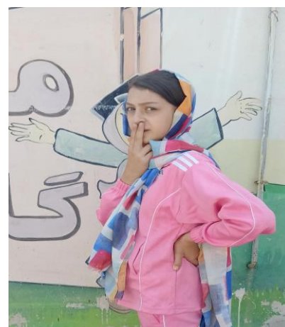
Fig. 19: Space buttons

2-5-19. Space buttons: The student stands with her right foot in front of her left foot and does not need to stretch. The index finger and middle of the left hand are gently placed on the space between the nose and the upper lip, rubbing the area with her fingers in a circular motion and bending her torso on her right foot while breathing. She raises her torso, focuses with her eyes on the farthest point, and bends the torso again and looks at her right foot. She repeats the movement four to five times and changes her legs and arms.