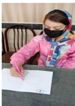
Fig. 1: Lazy 8

2-5-1. Lazy 8: Drawing a Latin figure 8 in the air with the right hand, left hand and simultaneously with both hands in different sizes and in different positions up, down, middle and around with the pursuit of the shape by the eyes. It will be repeated 8 times with both hands.