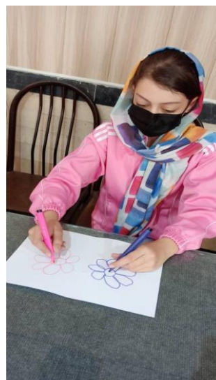
Fig. 6: The double doodle

ii) The student makes a movement by hearing each letter of the alphabet; the sign I (a) means raising the left hand, the sign T (b) means raising both hands and the sign R (c) means raising the right hand.