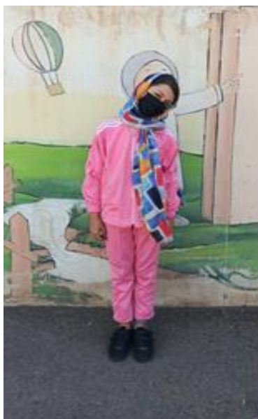
Fig. 4: Neck rolls

2-5-5. Think of an X: The student closes her eyes and imagines looking at a large X. If it is difficult for her, she can draw a large X in the middle of a sheet of white paper and look at it right in front of her eyes.