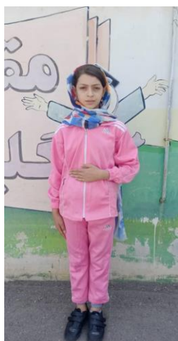
Fig. 8: Belly breathing

2-5-9. The Energizer: The student sits on a chair, comfortably separates her legs and puts her hands on her knees, in a resting position. Then, she bends her head and torso and brings them down to her knees until they feel comfortable; takes a deep breath and slowly releases the trunk as she raises it, repeating this movement for two to three times.