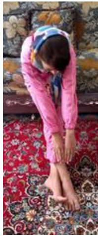
Fig. 12: Gravity Glider

releases her foot and her breath with 8 numbers. This movement is repeated four times for each foot.