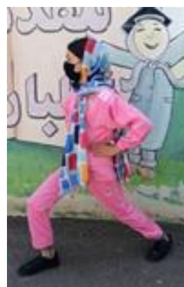
Fig. 11: The Grounder

2-5-11. The Grounder: The student stands on a flat, firm surface with her right foot on the right side of her body, turning as far as possible and pointing to the right with her right foot. Then she takes a deep breath, and while slowly releasing it with 8 numbers, she bends the right knee to the right and moves until the knee reaches exactly to the toes. She repeats this movement twice. She also performs this activity twice with her left foot.