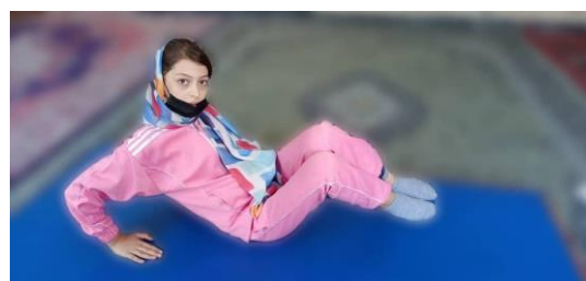
Fig. 7: The Rocker

2-5-7. The Rocker: The student sits on a solid surface. Leaning on her hands in the back, she raises her bent knees. The sacrum should be on the ground and the sacrum should be shaken to scratch the infinite mark.