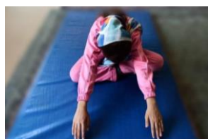
Fig. 9: The Energizer

2-5-10. Calf pump: The student stands in front of a wall and leans on it, brings the right foot back, and lifts the heel, leans on the left foot, and takes a deep breath, releases with the breath and the heels in 8 numbers. She brings the right heel to the ground. Feels comfortable and raises the heel again and repeats her action for 3 times. This movement is done with both feet.