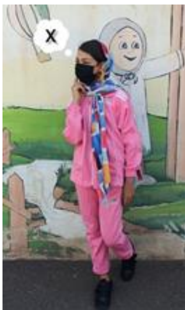
Fig. 5: Think of an X

2-5-5. Think of an X: The student closes her eyes and imagines looking at a large X. If it is difficult for her, she can draw a large X in the middle of a sheet of white paper and look at it right in front of her eyes.