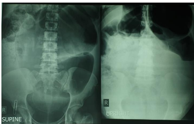
Fig.1: Abdominal X-ray image (lying / standing) showing fluid-air surface of dilated colon with inverted -U view.

pelvic X-ray showed a dilated bowel with a bent inner tube view ( Figure.1 ).