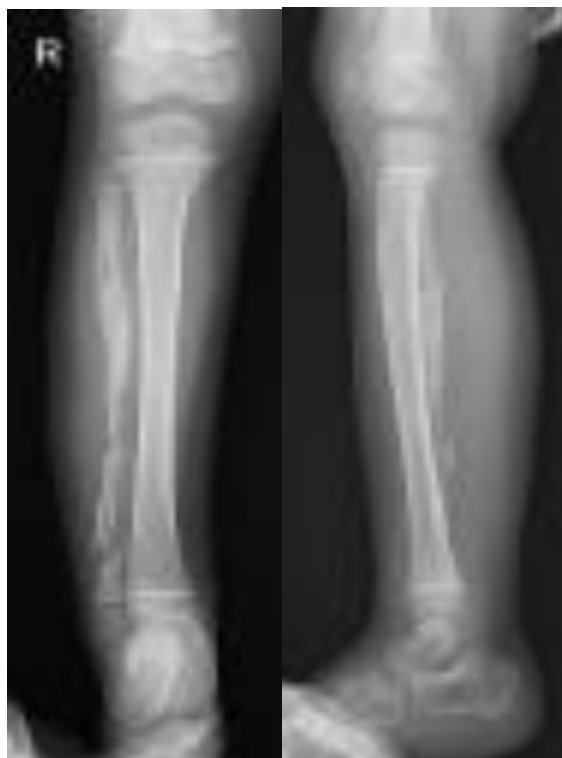
Fig.1. X-ray of the right leg before medical treatment.

revealed negative results. During the next 24 h, the fever dropped and her signs and symptoms of inflammation decreased. However, the ESR level remained high (37 mm/hr).