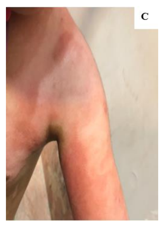
Fig.2: (A & B) Multiple papular and nodular lesions on the shoulder and arm burn scars in a 32 month-old girl; (C) 4 weeks later lesions disappear without any scar.