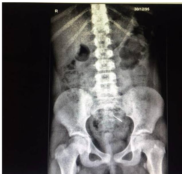
Fig.3: Follow up abdominal X-ray after 24 h revealed that the needle passed the small intestine and was in the colon.