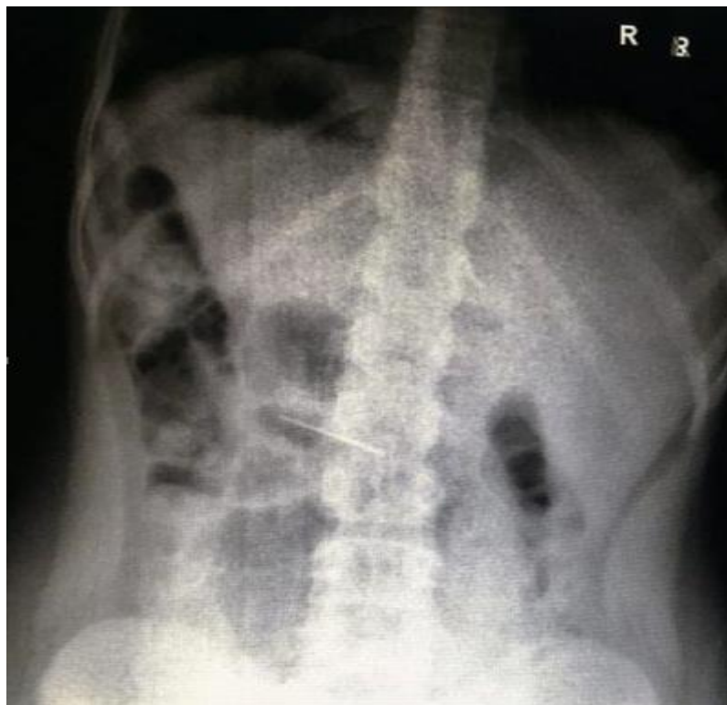
Fig.2: Abdominal X-ray showing the needle had passed the pylorus.