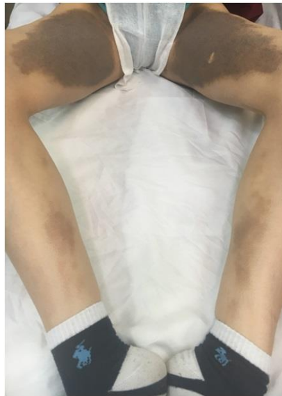
Fig.1: Large hyperpigmented plaques with hypertrichosis and induration, irregular border and rough surface in medial aspect of both thighs.