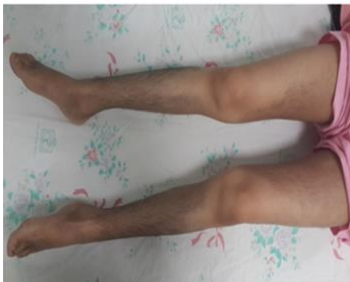
Fig. 4a: Symmetric mild stiffness, hyperpigmented hypertrichotic plaques on her thighs and shins with sparing of knees.