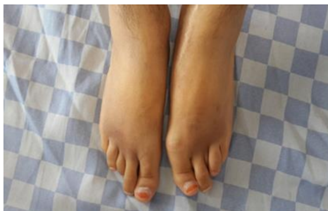
Fig. 4b: The left side hallux valgus and crossover of fourth toe.