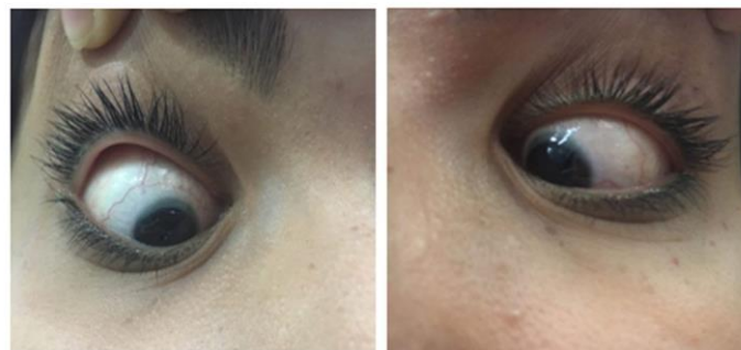
Fig. 2a: The bilateral arcus senilis.