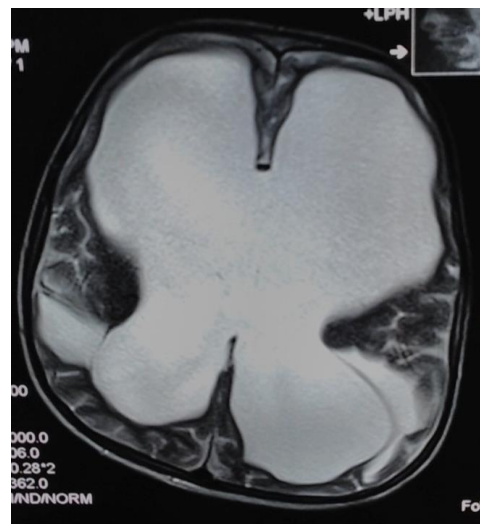
Fig.4: Axial T2 MRI image in a 10 years old male show massive hydrocephalus with periventricular edema.