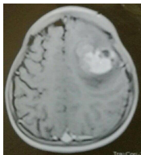
Fig.5: Axial T1 post-contrast MRI image in a 7 years female patient shows left-sided parietal abscess.